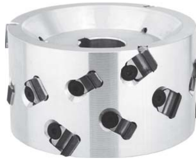
The Stehle 3588 DP Jointing Cutterhead: The noise reduction of up to 3 dB makes working more comfortable.

The Stehle DP Jointing Cutterhead is the new low-weight and low-noise alternative to a brazed diamond jointing cutter. The Stehle DP Jointing Cutterhead is configured for users with high quality demands and focus on resource-saving (energy and material consumption).